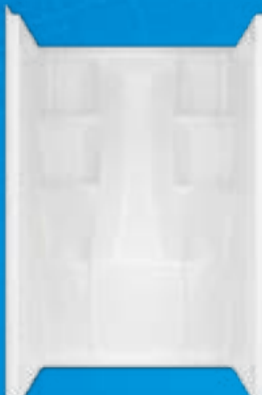
3 Pc. 48" White Shower Wall Kit