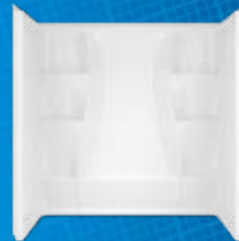
3 Pc. 60" White Shower Wall Set