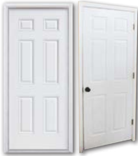
Colonist 6 Panel Interior Door Units Includes colonial trim for both sides.