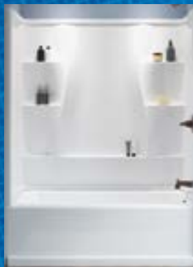
3 Pc. White Bathtub Wall Set

1-Handle Chrome Tub & Shower Faucet 82603 (82603)